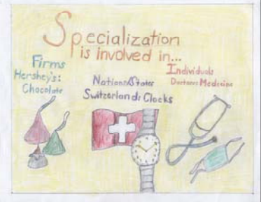
Katherine G.-Washington Gifted School, Peoria State Winner-2008